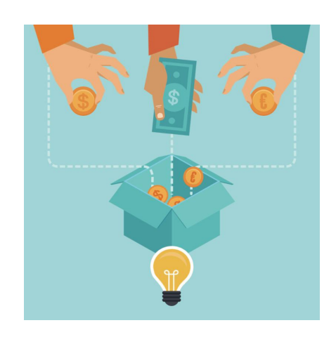
Cornerstone Collaborative Florida's network of caring individuals and committed